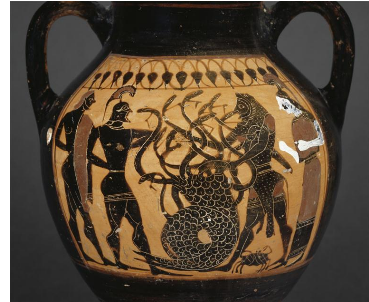
Scorpio Labor LoH p 140-154