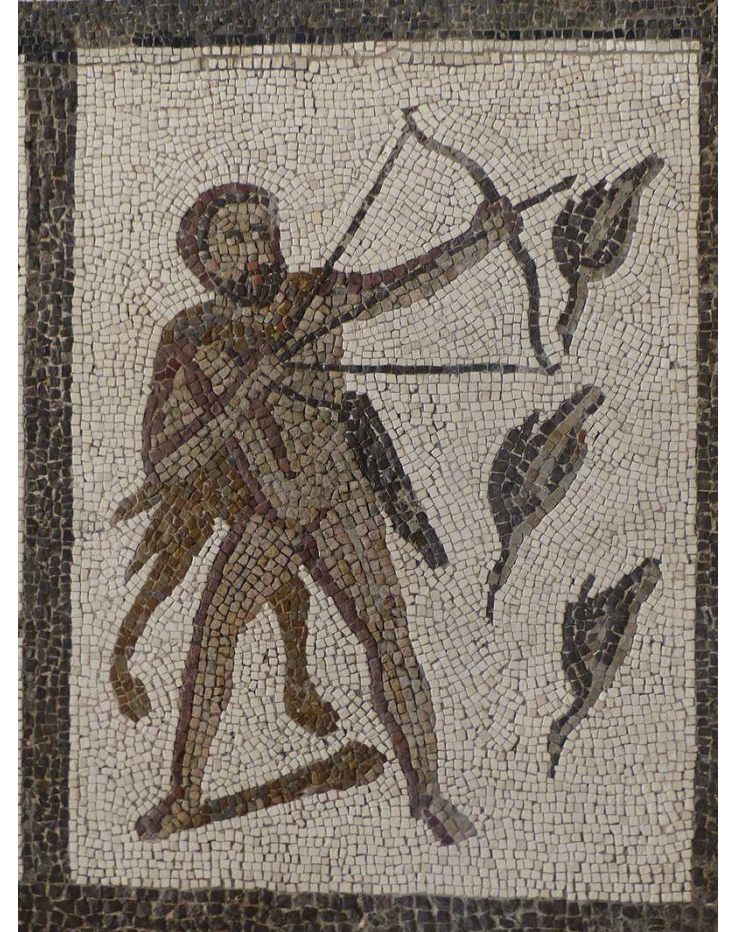
Sagittarius Journey LoH p 228