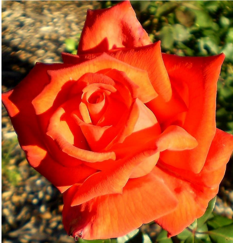
Rose

I come forth, and from the plane of mind I rule.