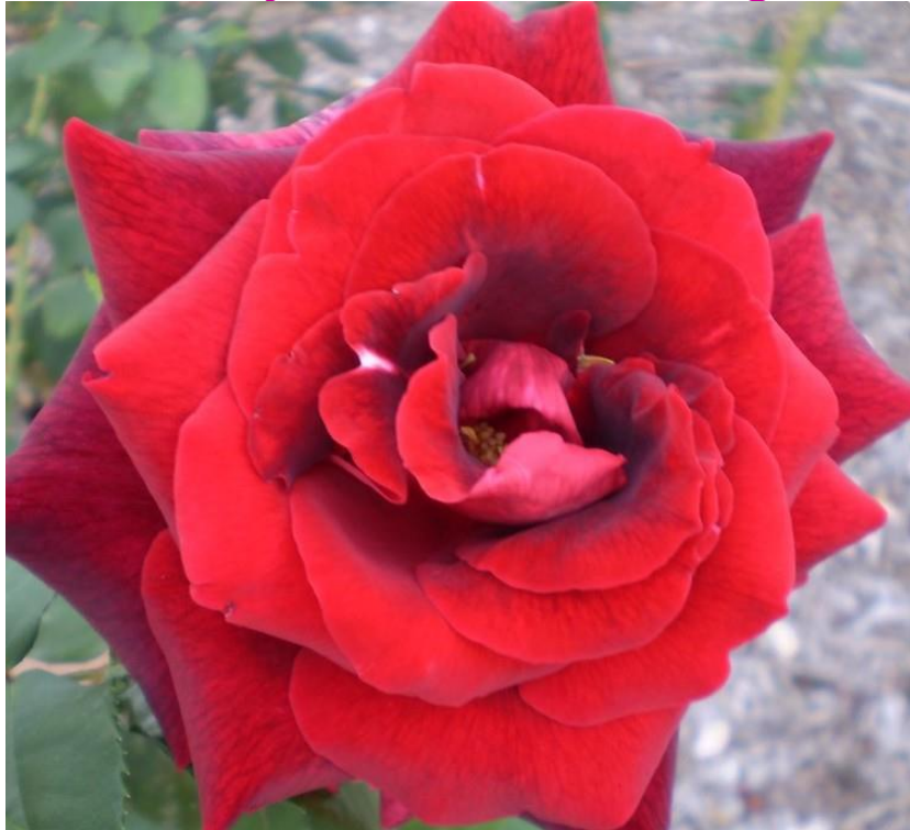
Rose

“Warrior I am, and from the battle I emerge triumphant”