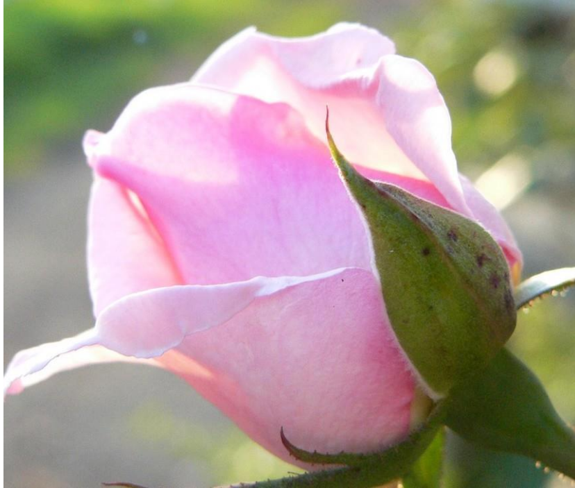
Rose

“Lost am I in light supernal, yet on that light I turn my back”