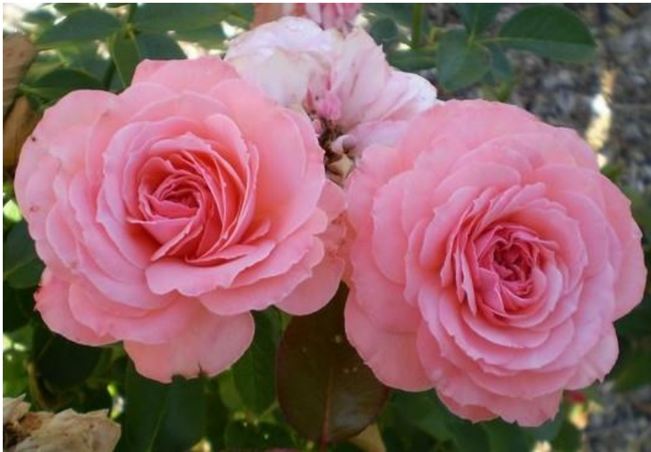
Rose

"I recognise my other self and in the waning of that self I grow and glow"